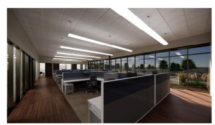
INTERIOR RENDERING - OPEN OFFICE AREA CONCEPT