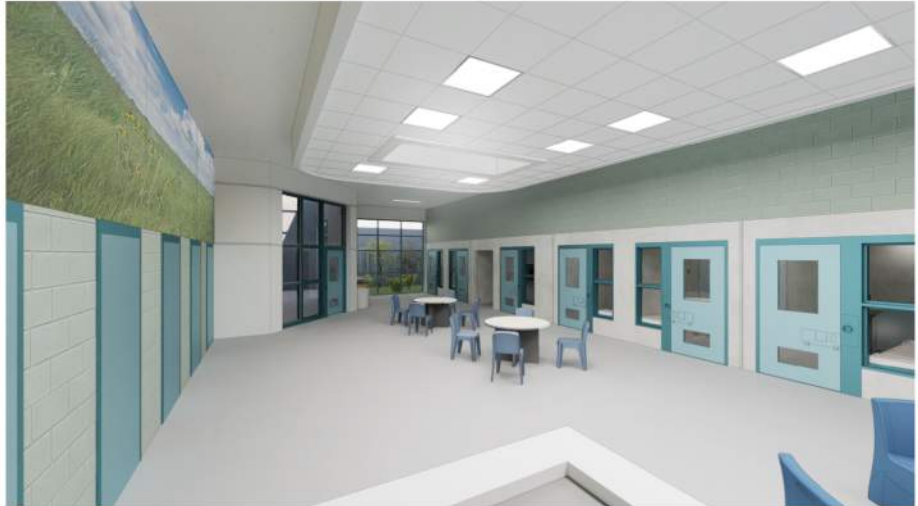
INTERIOR DAYROOM PERSPECTIVE VIEW FROM OFFICER WORKSTATION