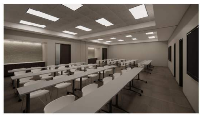
INTERIOR RENDERING - TRAINING CLASSROOM