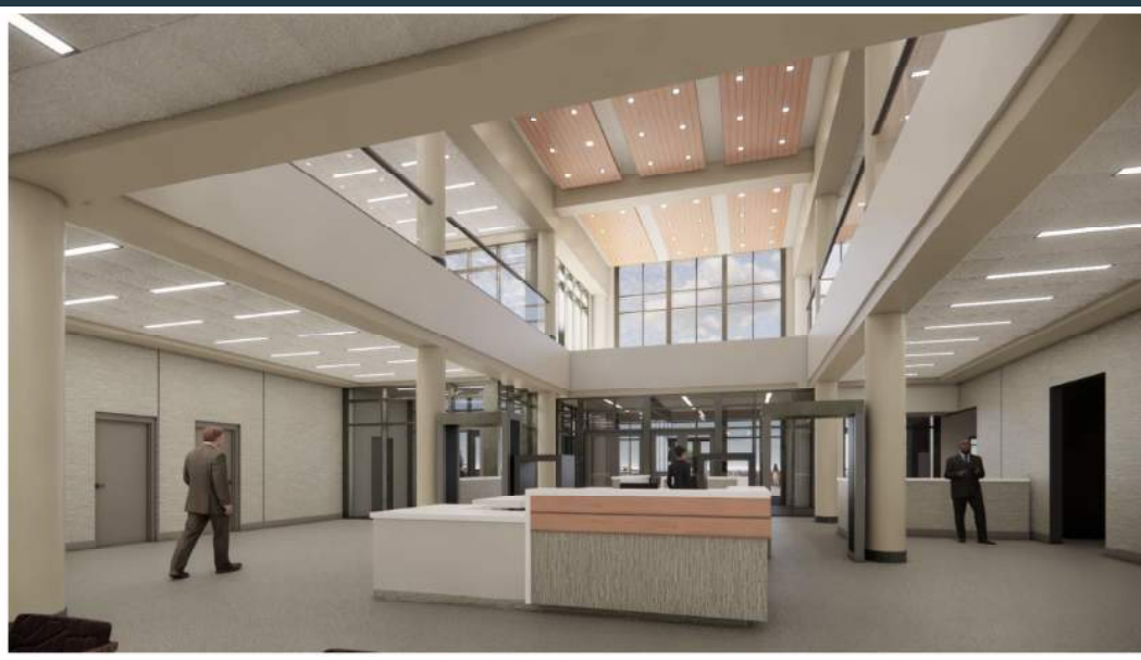
INTERIOR RENDERING - PUBLIC LOBBY CONCEPT