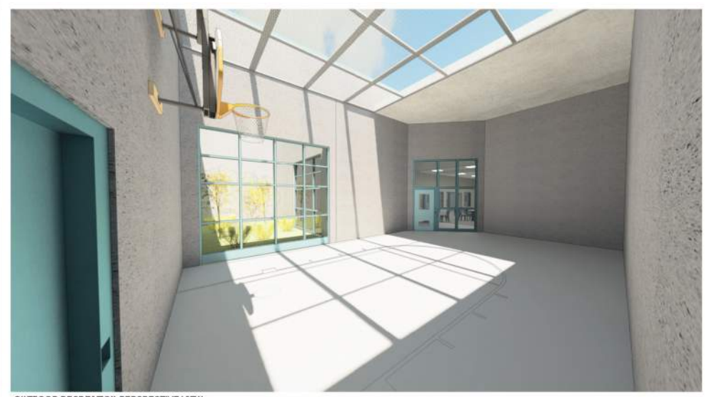
OUTDOOR RECREATION PERSPECTIVE VIEW