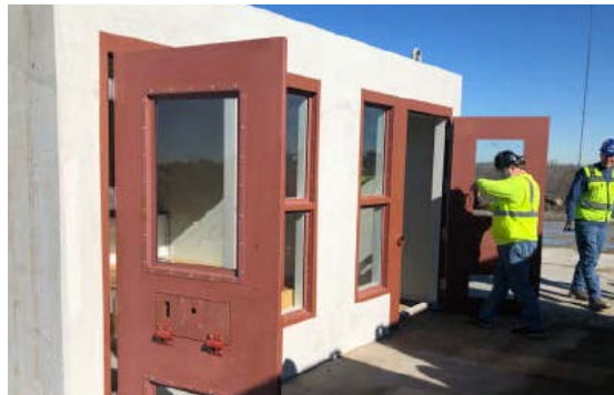
Precast Cell Module Mockups