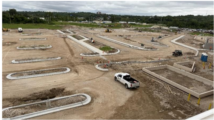
Above: Images of the staff and visitor parking and building entry.