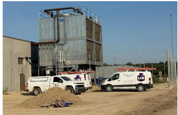
Above: Central utility plant.