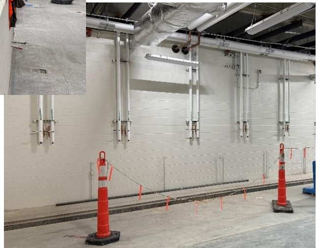
Above: Kitchen and Laundry areas prior to equipment installation.