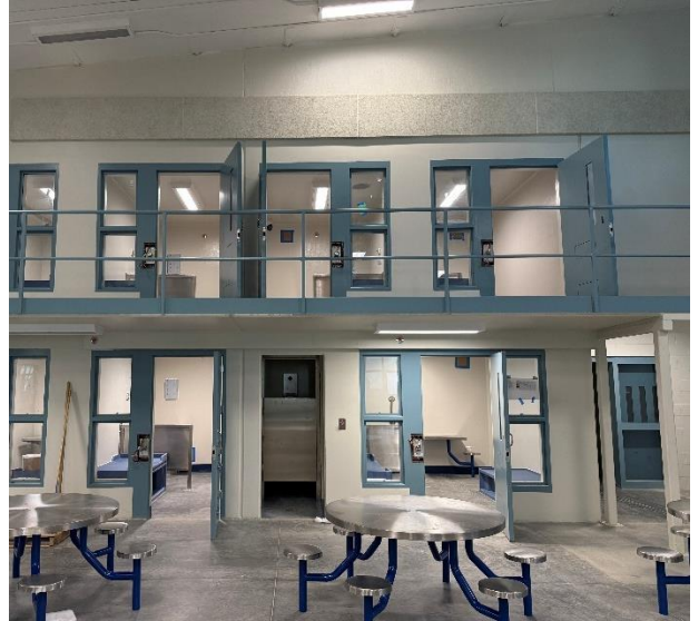
Above: Inmate dayroom and housing.