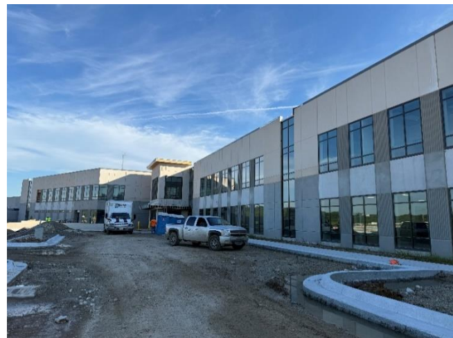
Above: Images of Ewing Avenue and the building façade.