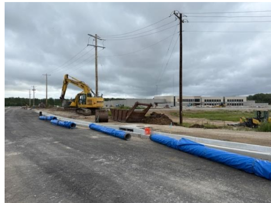
Above: Images of Ewing Avenue and the installation of the new City water main.