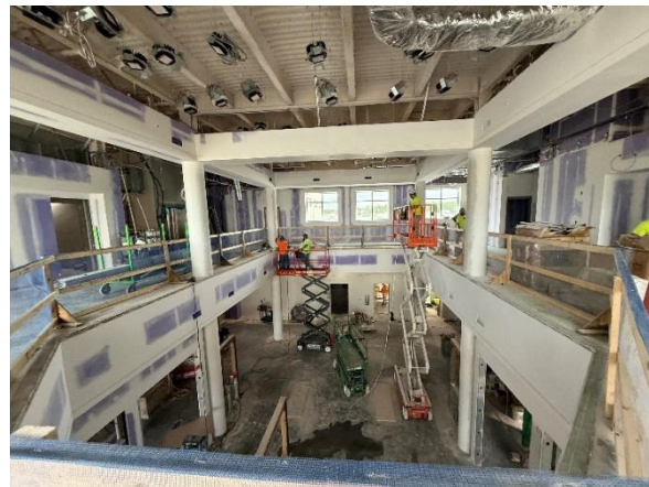
Above: Images of the building façade and the lobby from the second floor.