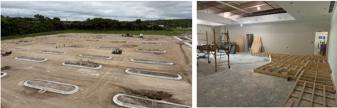
Above: Visitor parking area ready for paving and court rough in bench area.