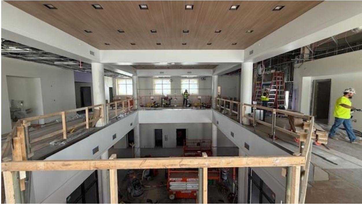
Above and Below: View of Two-Story entry. Second floor administrative spaces.