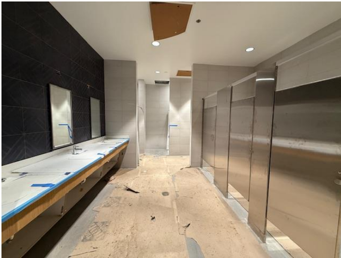
Above: Public Restrooms