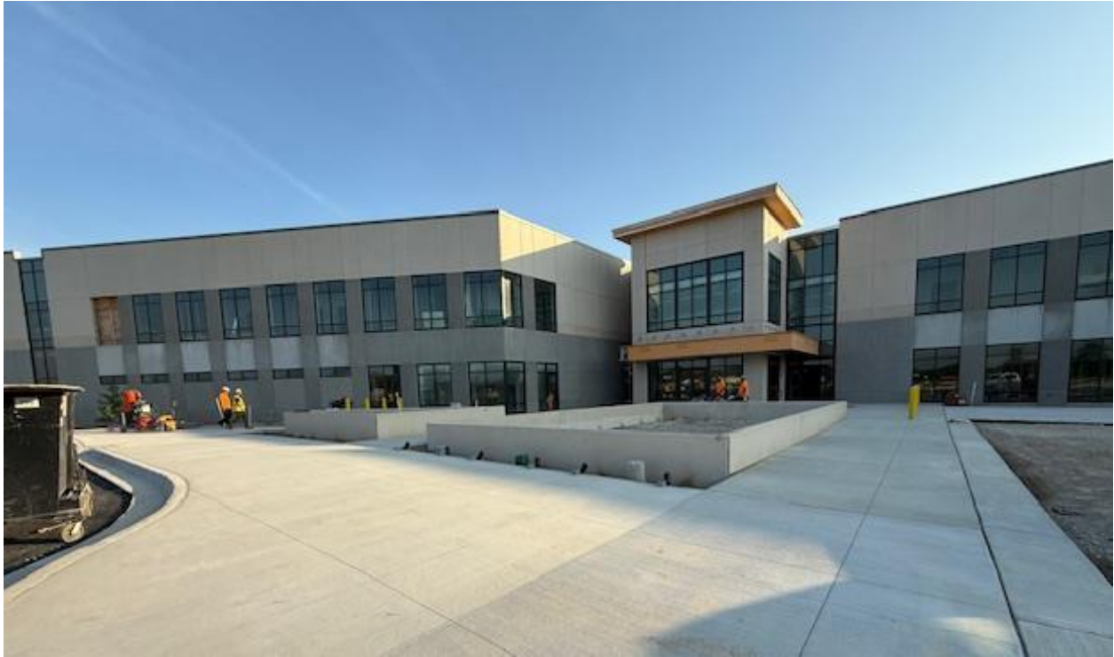
Above: Image of Public Entry and Front Façade.