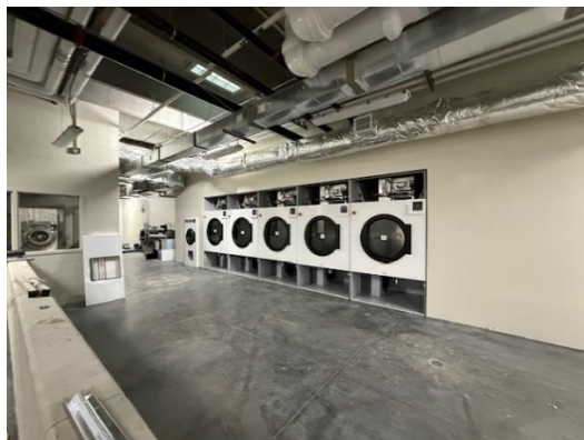
Above: Laundry Facility