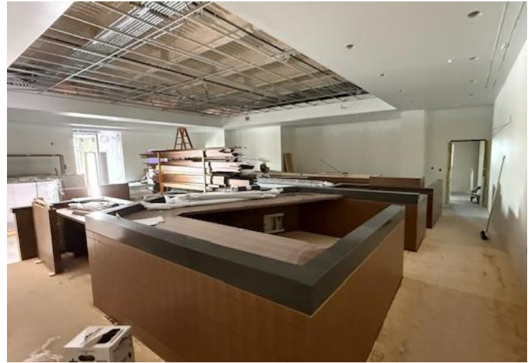
Above: Courtroom Construction